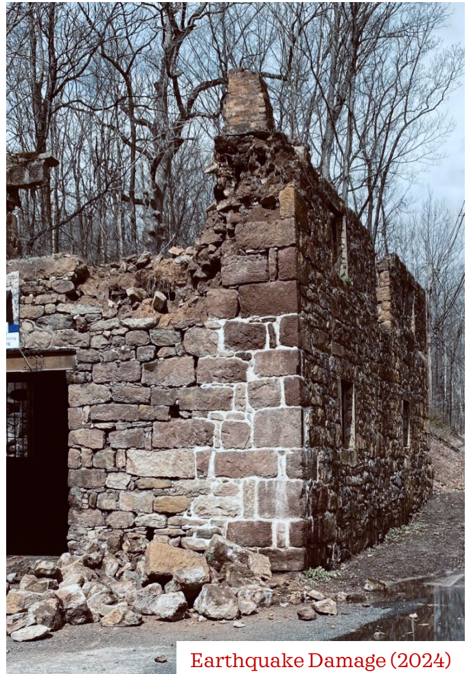
Earthquake Damage (2024)